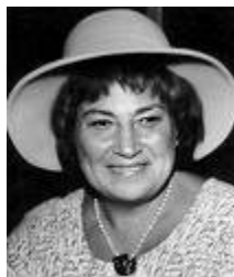
Bella Savitzky Abzug 1920-1998

NOW, THEREFORE, BE IT RESOLVED, the Senate and House of Representatives of the United States of America in Congress assembled, that August 26th of each year is designated as "Women's Equality Day," and the President is authorized and requested to issue a proclamation annually in commemoration of that day in 1920, on which the women of America were first given the right to vote, and that day in 1970, on which a nationwide demonstration for women's rights took place.